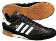
Indoor soccer shoes (two examples)